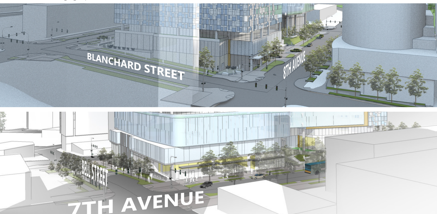
Figure 5. The Commission asked for greater detail of the pedestrian experience at the several public spaces in the proposed development and along the two Green Streets.