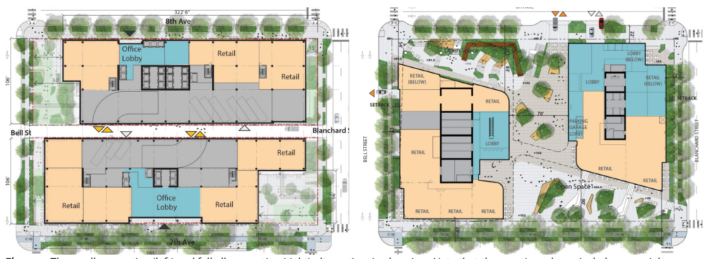
Figure 2. The no alley vacation (left) and full alley vacation (right) alterantives in plan view. Note that the vacation scheme includes an aerial connection between the two buildings at the third and fourth floors as illustrated by the dashed line.

Several perspectives and site plans helped to distinguish the no vacation and vacation proposals. While both proposals include two buildings of similar height, the vacation alternative reorients the building masses from north—south to east—west.