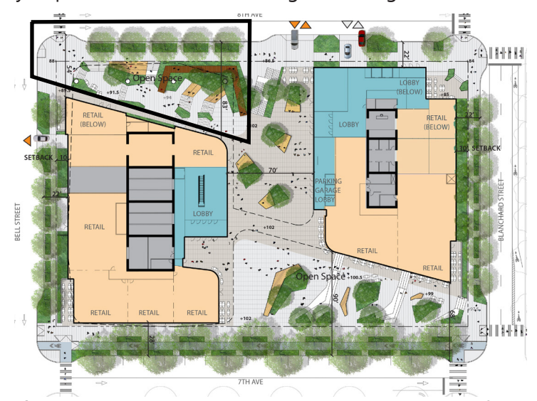
Figure 6. The Commission was especially concerned with the corner of 8th Ave and Bell St, outlined in black.