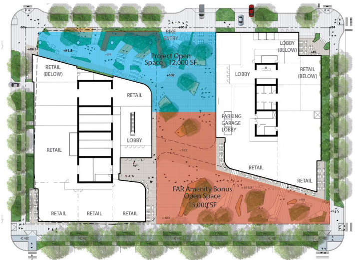
Figure 3. A site plan shows the open space required for the FAR bonus.

A series of diagrams compared the no vacation and vacation schemes on program elements including open space, vehicle access, loading and service access, ground-level uses, tower massing, and solar access. Finally, Mr. Krech summarized with a series of observations about how the vacation proposal affects circulation; access; utilities; light, air, and open space; and views.